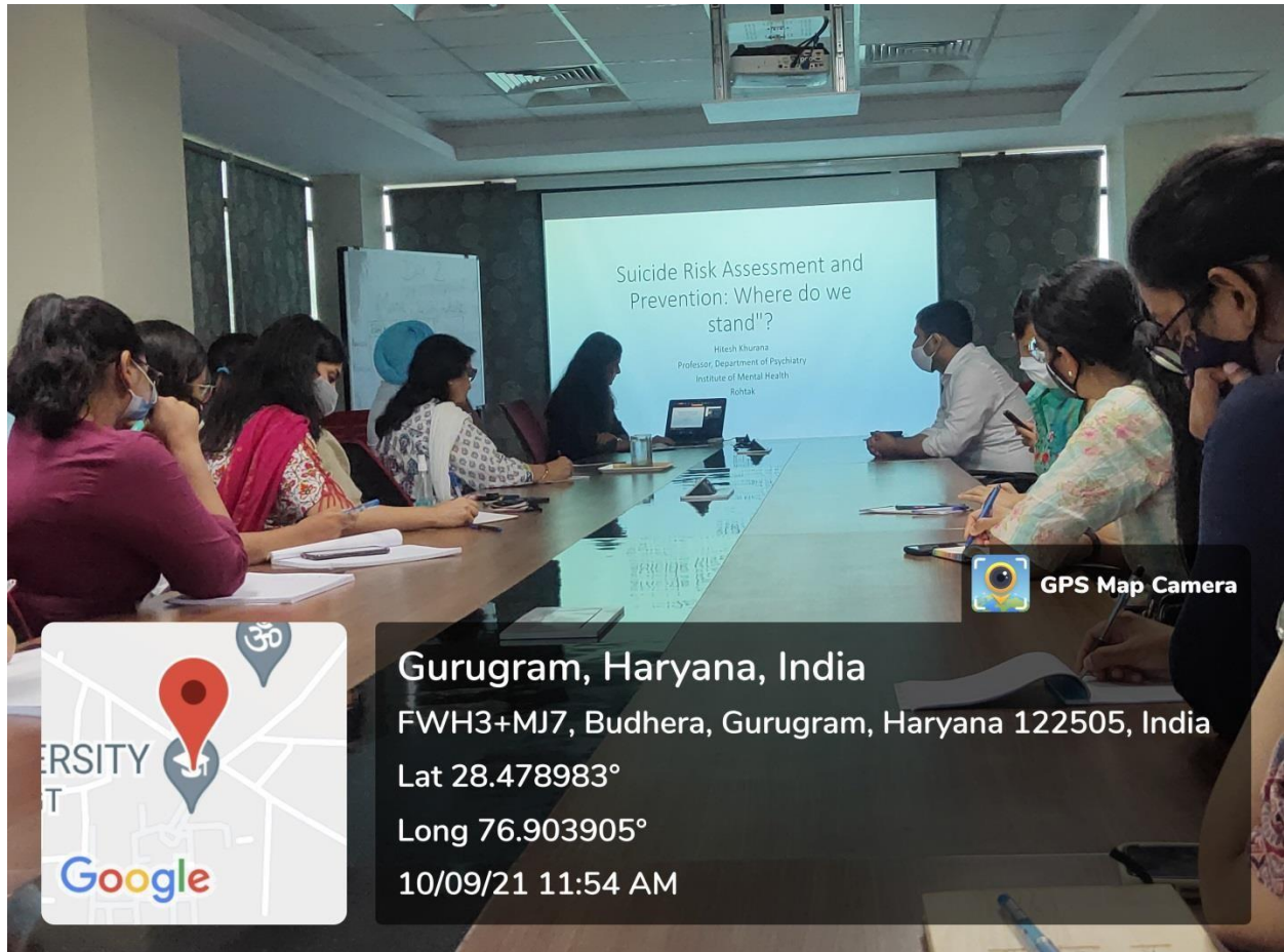
Figure 4: Webinar on “Suicide Risk Assessment and Prevention: Where do we stand?”

Budhera, Gurugram-Badli Road, Gurugram (Haryana) – 122505 Ph. : 0124-2278183, 2278184, 2278185