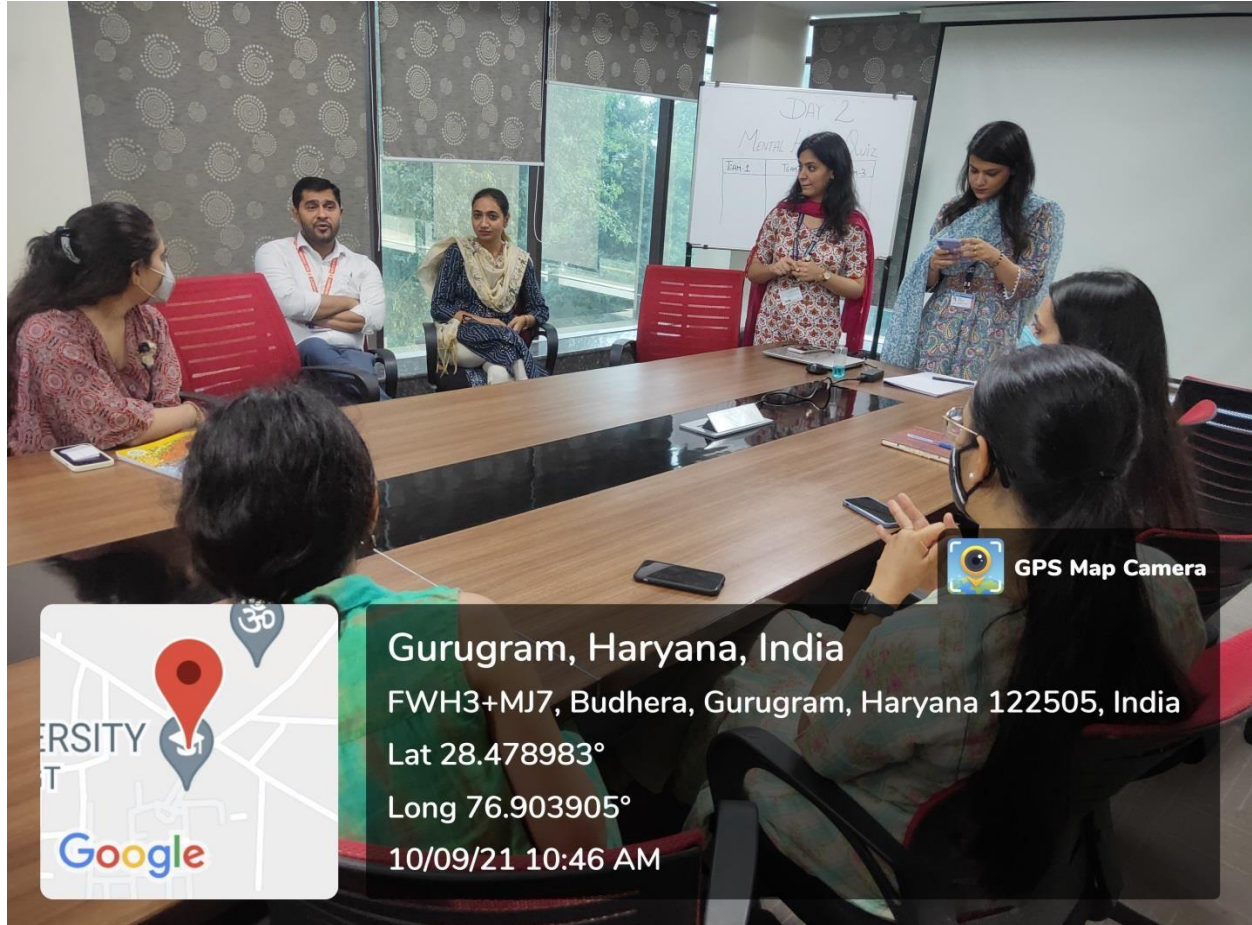
Figure 3: Students and Faculty members during Mental Health Quiz. :

Budhera, Gurugram-Badli Road, Gurugram (Haryana) – 122505 Ph. : 0124-2278183, 2278184, 2278185